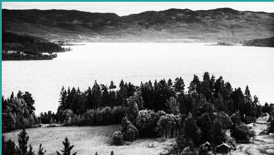
Halvorsbøle overlooking the Ransdjord lake